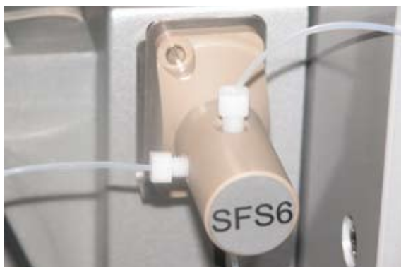
▼ Injection module SFS 6