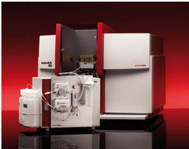
▼ novAA® 350 with hydride system