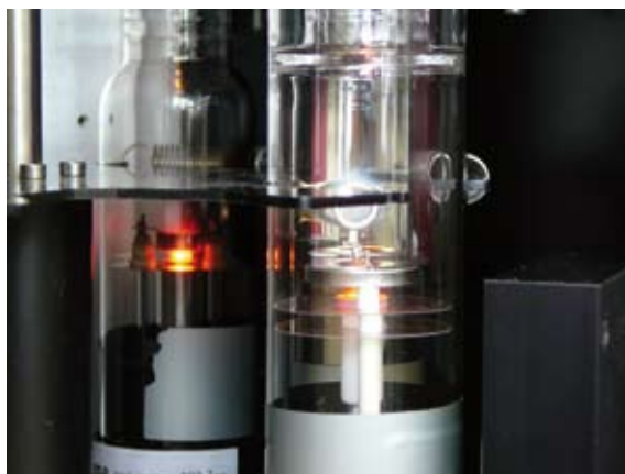
▲ 8 lamp turret

The concept of this simple accessory is easy to use for best reproducible results.