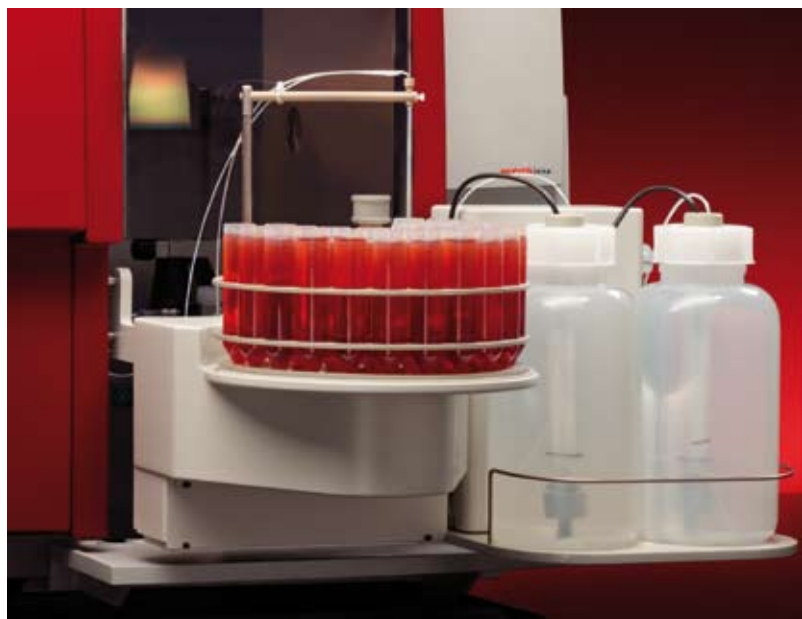
▲ novAA® 350 with flame autosampler

An electrothermal heating cell is fully integrated as a standard in the hydride systems (HS 55/ HS 60) and offers enhanced performance and reproducible temperature conditions.